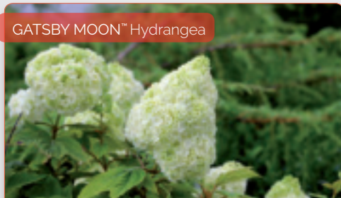
GATSBY MOON™ Hydrangea

Proven Winners® varieties: TUFF STUFF™ series