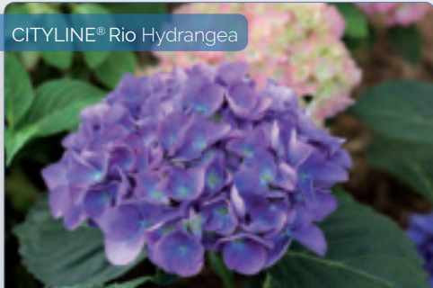
CITYLINE® Rio Hydrangea

Hydrangea Fun Fact There are about 49 species of hydrangeas. Four species are native to North America, including smooth hydrangea and oakleaf hydrangea.